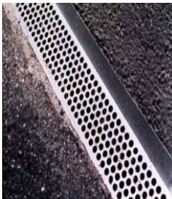
Distance-Plate pat. Alu-Lüftungsprofil