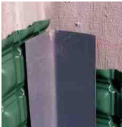
Distance-Plate pat. Winkelprofil